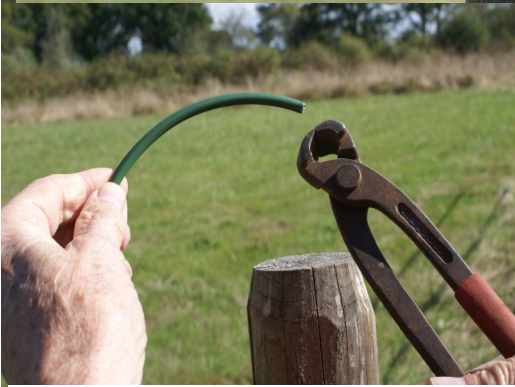
Measure and cut necessary wire needed