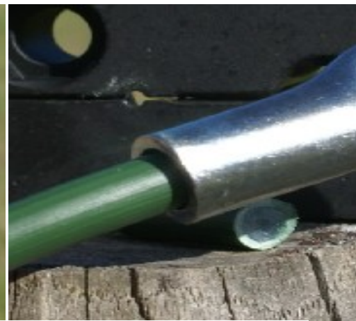
Push the cable until it is completely on lug