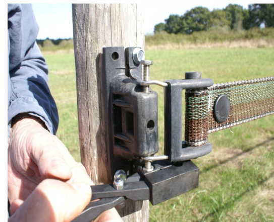
Other uses for the Crimper tool: Handy socket wrench