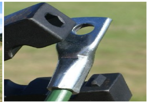
You have completed a professional crimp