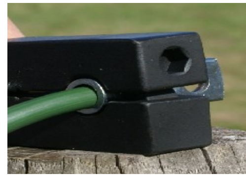
Place the lug into the "CRIMP" slot