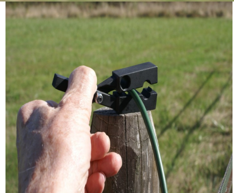
Position the crimper tool on top of a strong post or hard surface