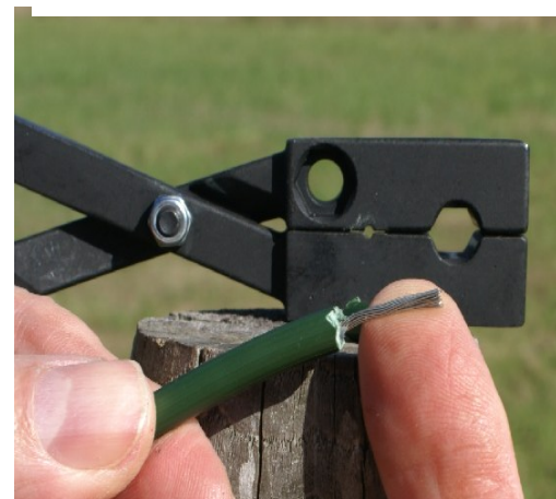
Fold the exposed cable over the insulation