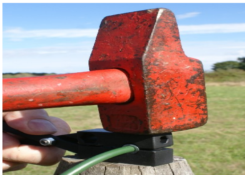
Hit HARD 6 or 7 times to ensure proper crimp