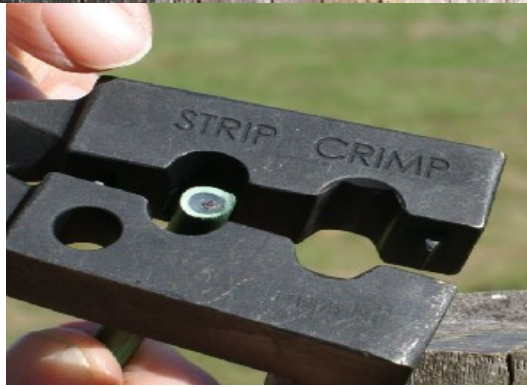
Please cable into the "STRIP" slot