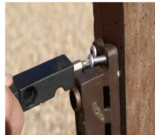
for use as a screw or torx driver